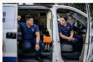
Criminal Justice >