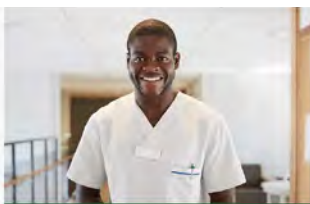
Health Sciences >