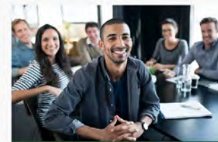
Liberal Arts >