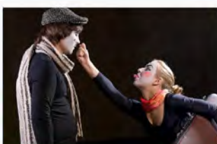
Theater & Performing Arts >

SUNY Sullivan's numerous degree and certificate programs give you the tools to turn your passion into a career!