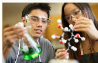
Math & Science >