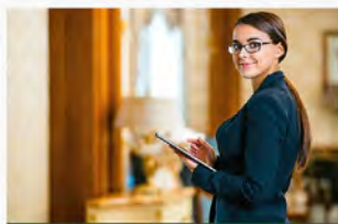
Hospitality & Tourism >