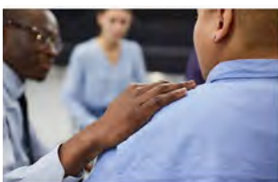
Psychology & Human Services >