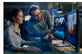
Digital Media & Creative Arts