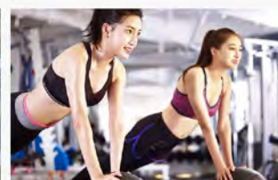
Sports, Fitness & Wellness >