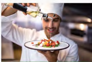
Culinary Arts >