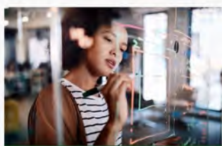
Business & Entrepreneurship >