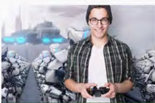
Computer Science >